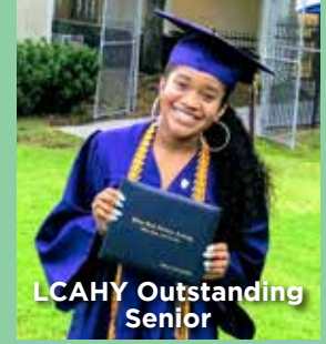
LCAHY Outstanding Senior