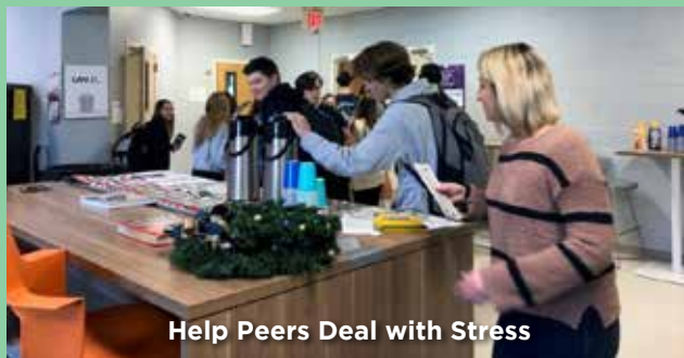
Help Peers Deal with Stress