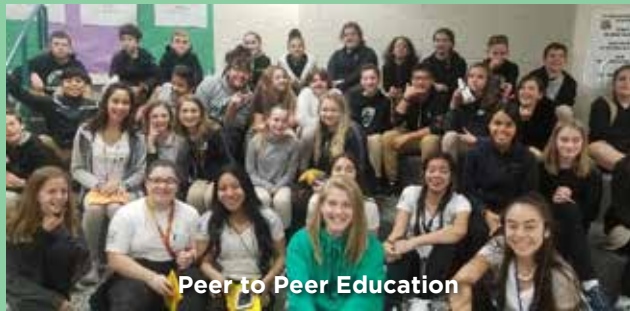
Peer to Peer Education