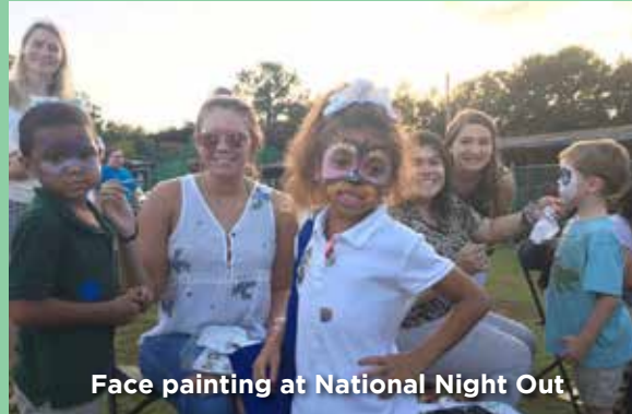
Face painting at National Night Out