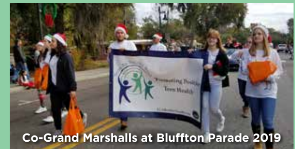
Co-Grand Marshalls at Bluffton Parade 2019