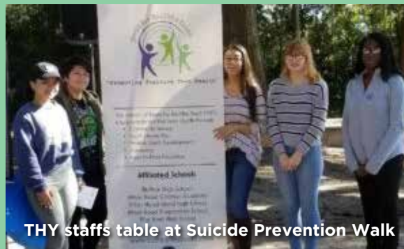
THY staffs table at Suicide Prevention Walk