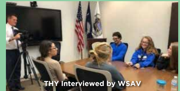
THY Interviewed by WSAV