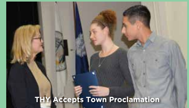
THY Accepts Town Proclamation