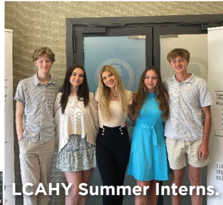
LCAHY Summer Interns.