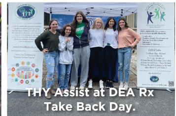
THY Assist at DEA Rx Take Back Day.