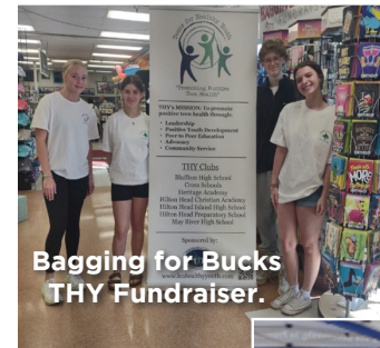
Bagging for Bucks THY Fundraiser.