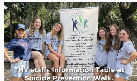
THY staffs Information Table at Suicide Prevention Walk.