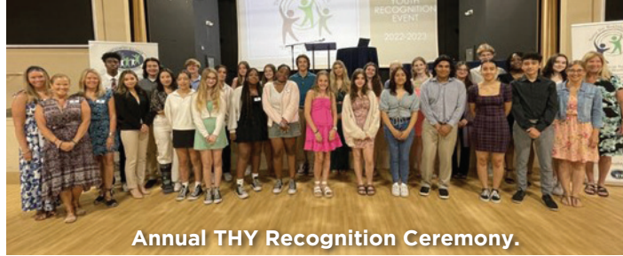
Annual THY Recognition Ceremony.