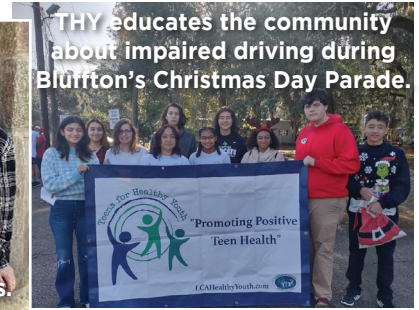
THY educates the community about impaired driving during Bluffton's Christmas Day Parade.