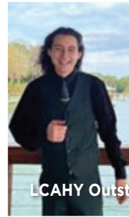
LCAHY Outstanding Senior Scholarship Recipients.