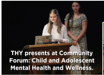
THY presents at Community Forum: Child and Adolescent Mental Health and Wellness.