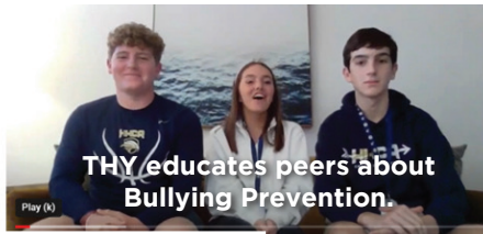
THY educates peers about Bullying Prevention.