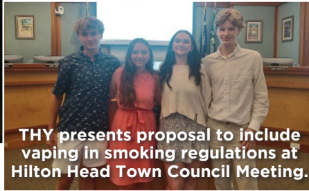
THY presents proposal to include vaping in smoking regulations at Hilton Head Town Council Meeting.