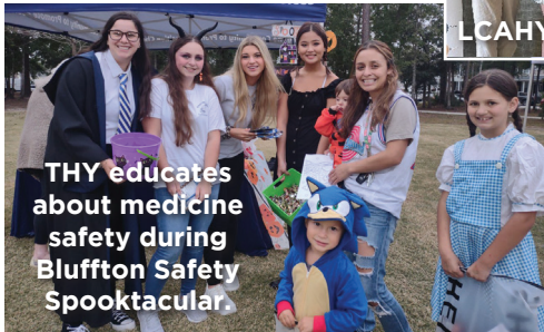
THY educates about medicine safety during Bluffton Safety Spooktacular.